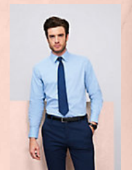
SOL'S BRIGHTON 17000