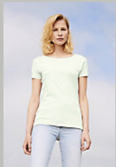
SOL'S MARTIN WOMEN 02856