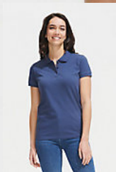
SOL'S PERFECT WOMEN 11347