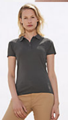
SOL'S PRESCOTT WOMEN 11376