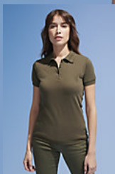
SOL'S PRIME WOMEN 00573