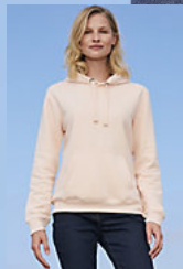
SOL'S SPENCER WOMEN 03103