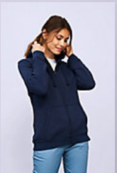
SOL'S SPIKE WOMEN 03106