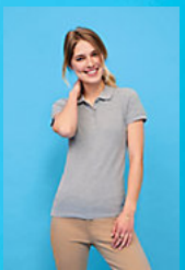
SOL'S PEOPLE 11310