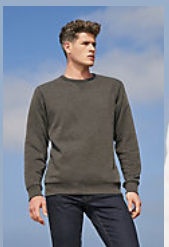
SOL'S SULLY 02990