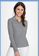
SOL'S PODIUM 11317