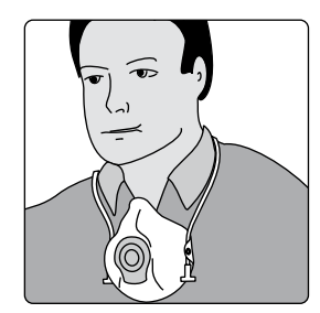
6. Let mask hang around your neck.