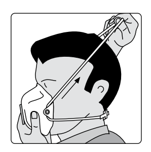
3. Pull upper strap and place on back of head.