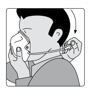
Place respirator on chin and pull loop over head tight to the neck.