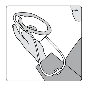
1. Pull strap to form a large loop.