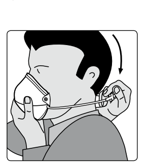
Place respirator on chin and pull loop over head tight to the neck.