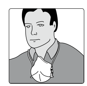
6. Let mask hang around your neck.