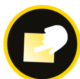
LUXURIOUS SOFT TOUCH FABRIC