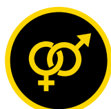
FOR BOTH MEN & WOMEN