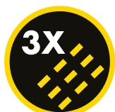
TRIPLE STITCHED SEAMS