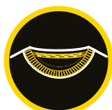
TAPED NECKLINE FOR COMFORT