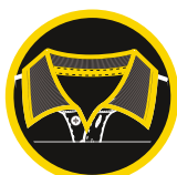
TAPED NECKLINE FOR COMFORT