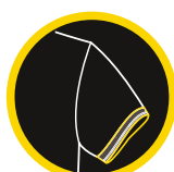
CUFFED SLEEVE WITH MATCHING ROD DESIGN