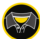
HALF MOON YOKE