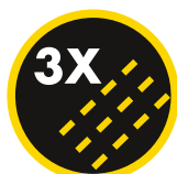
TRIPLE STITCHED SEAMS