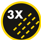
TRIPLE STITCHED SEAMS