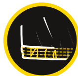
ELASTICATED CUFF AND WAISTBAND