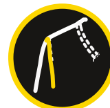
SET IN SLEEVE