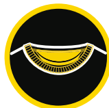
HALF MOON YOKE