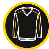
REFLECTIVE PIPING ON CONTRASTING ARM PANELS