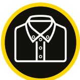
BUTTON DOWN COLLAR