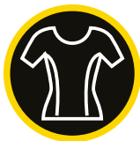
PRINCES SEAMS FOR FLATTERING SILHOUETTE