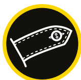
SELF FABRIC EPAULETTES