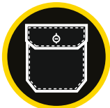
2 CHEST POCKETS WITH BUTTON DOWN FLAP