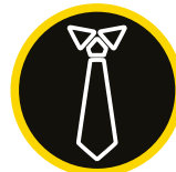
TEAM WITH OUR TIES TO COMPLETE THE LOOK