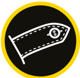
SELF FABRIC EPAULETTES