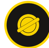
NON-SCRATCH HEAVY DUTY FIXING STUD