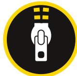
YKK MAIN ZIP LIFE TIME WARRANTY