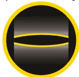
INTERNAL KNEEPAD POCKET