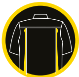
BACK ACTION PLEATS