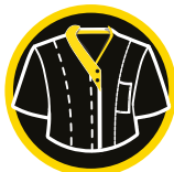
CONTRAST TRIM ON NECK