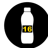
MADE FROM 16 PLASTIC BOTTLES