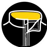
STAND UP COLLAR