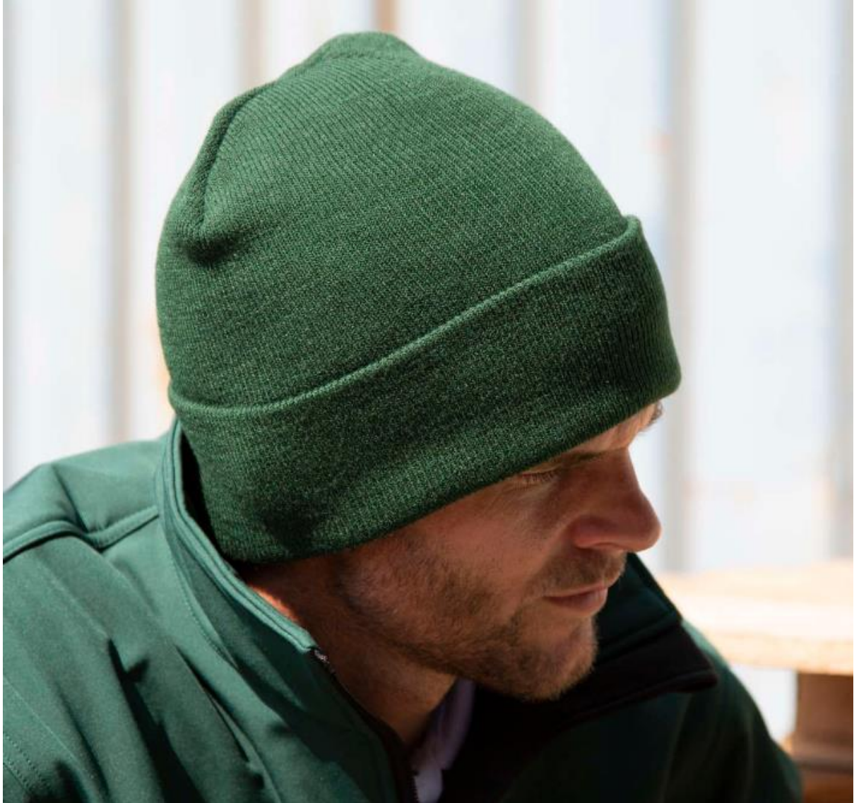
RC029X WOOLLY SKI HAT