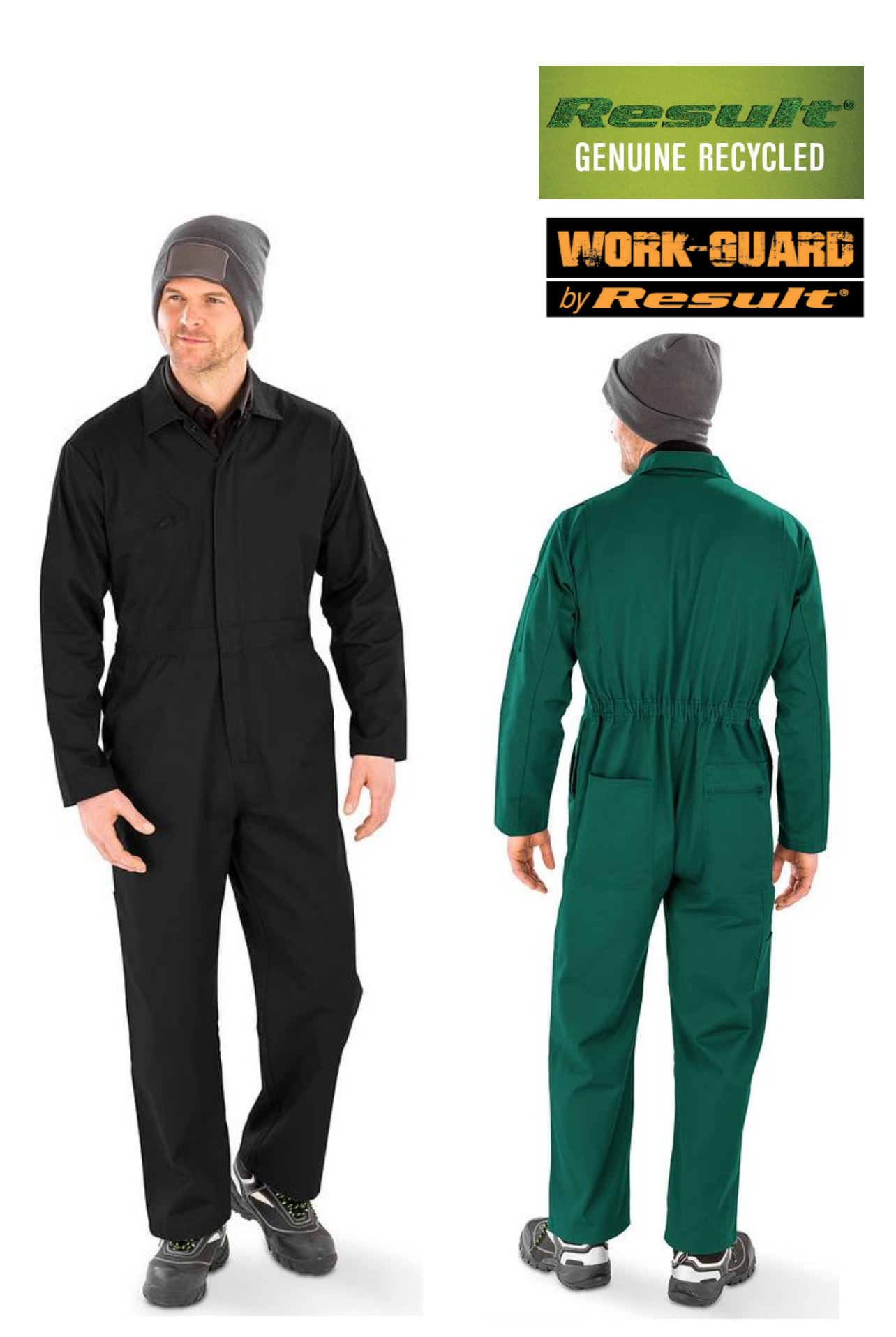
R510X RECYCLED ACTION OVERALL WITH ZIP FRONT