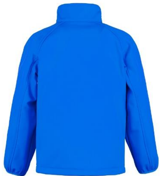
R901J&Y RECYCLED 2-LAYER PRINTABLE JUNIOR YOUTH SOFTSHELL JACKET