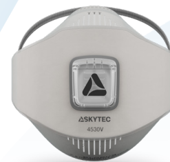
4530V FFP3 NR