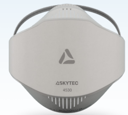
4530 FFP3 NR