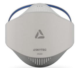
4520 FFP2 NR