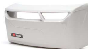
TR-6300FC Filter Cover